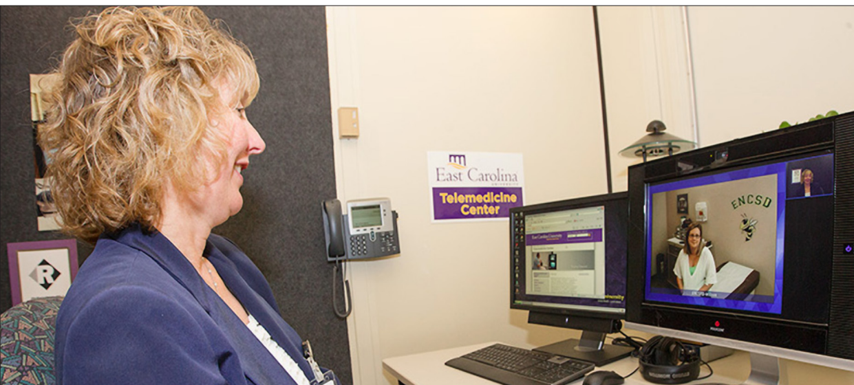
Telepsychiatry with the Eastern North Carolina School for the Deaf