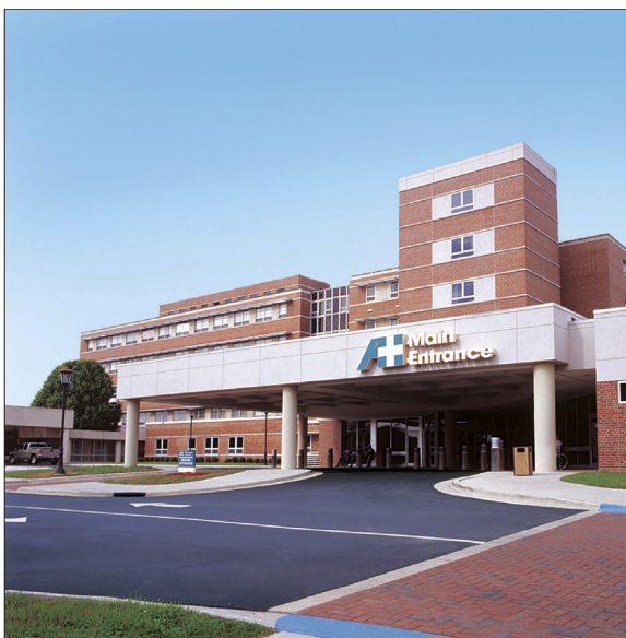
Albemarle Hospital in Elizabeth City

The result was an increasing number of uninsured patients arriving at the doors of the region’s hospital emergency rooms. Psychiatric lengths of stay for patients presenting to local emergency rooms with mental health issues began to burden the capacities of local hospitals. According to Donahue, many patients entering emergency rooms for psychiatric services only need a psychiatric